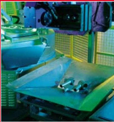
Unloading gripper or table